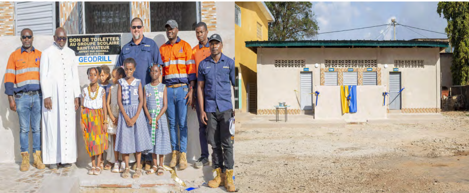
Geodrill Champions Community Welfare with the Gift of Sanitation in Bouaké School Project

Partnering with communities is a huge part of our corporate culture. We believe this core value benefits not only our surrounding communities but Geodrill and its employees as well. Our social impact focuses strongly on the communities we work in by supporting orphanages, schools and shelters; by transferring expertise and knowledge to empower local employees; by reducing our reliance on imports in order to boost the local economy; and by developing infrastructure to provide communities with safe drinking water.